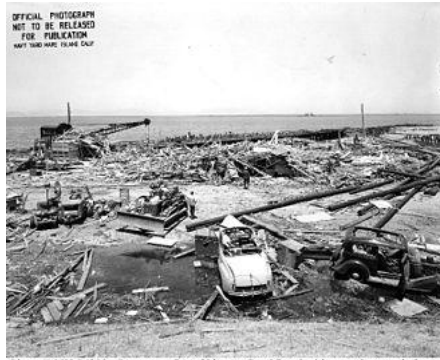
Photo # NH 96823 - Damage at Port Chicago, Ca. View looking north toward pier.